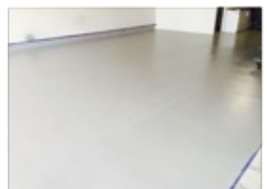
Non-Slip Floor Coating