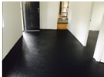
Non-Slip Floor Coating